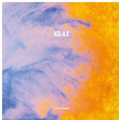
Album „Loose Frames“ (2017, Freifeld Tonträger)