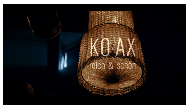
Live recording sessions at Treibhaus Innsbruck (2022)